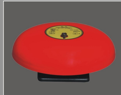
10" Bell HC-1024B