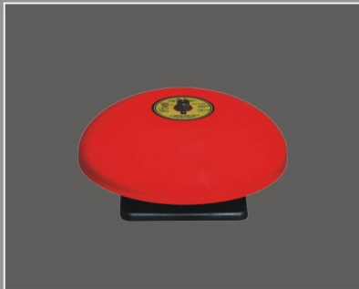
6" Bell HC-624B