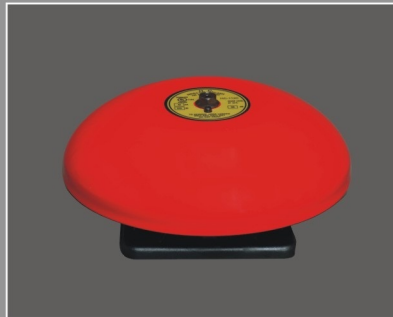
8" Bell HC-824B